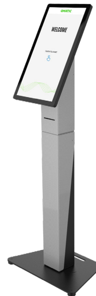
..... Floor stand