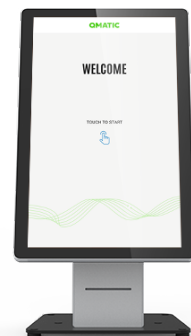
..... Tabletop stand